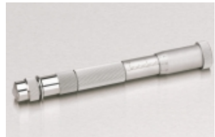
The IGT ink pipette

The use of an IGT ink pipette is strongly recommended because it increases the accuracy of application of ink and therefore the inking, thereby enhancing the performance of the tests.