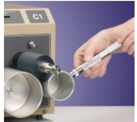
Applying ink with the IGT ink pipette

The distribution of the ink only takes about 30 seconds thanks to the diameter ratio and the oscillating drum movement. The inking time of the printing disc is about 15 seconds.