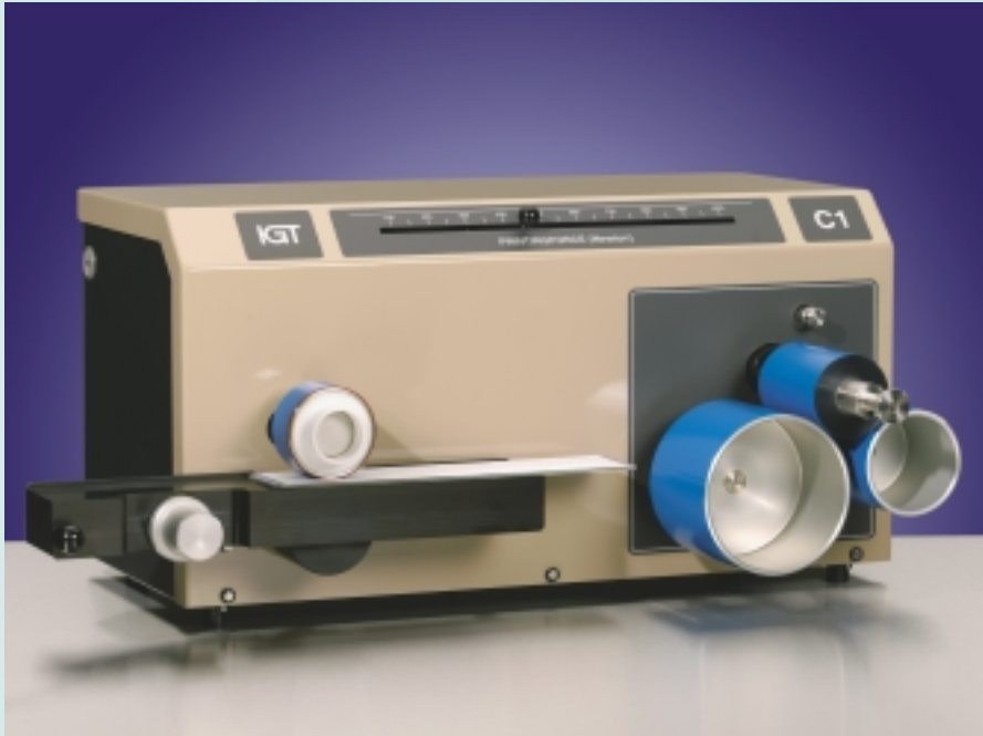
Making a print

Paper, board, plastic film, cellophane, laminate, metals, etc.