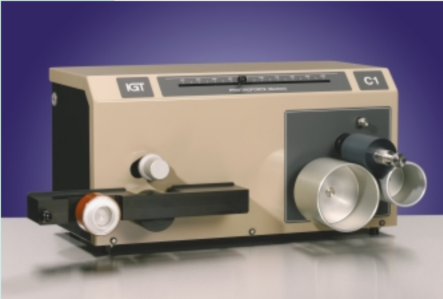
The C1, ready for use