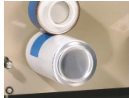
Making a print on a metal can

The standard printing disc is covered with coated rubber or a rubber blanket for conventional inks. Discs are also available with rubber or a rubber blanket for UV curing inks. Furthermore, there is a printing disc with an aluminium surface. The weight of the printing discs is less than 200 g, so that they can be weighed on analytical balances.